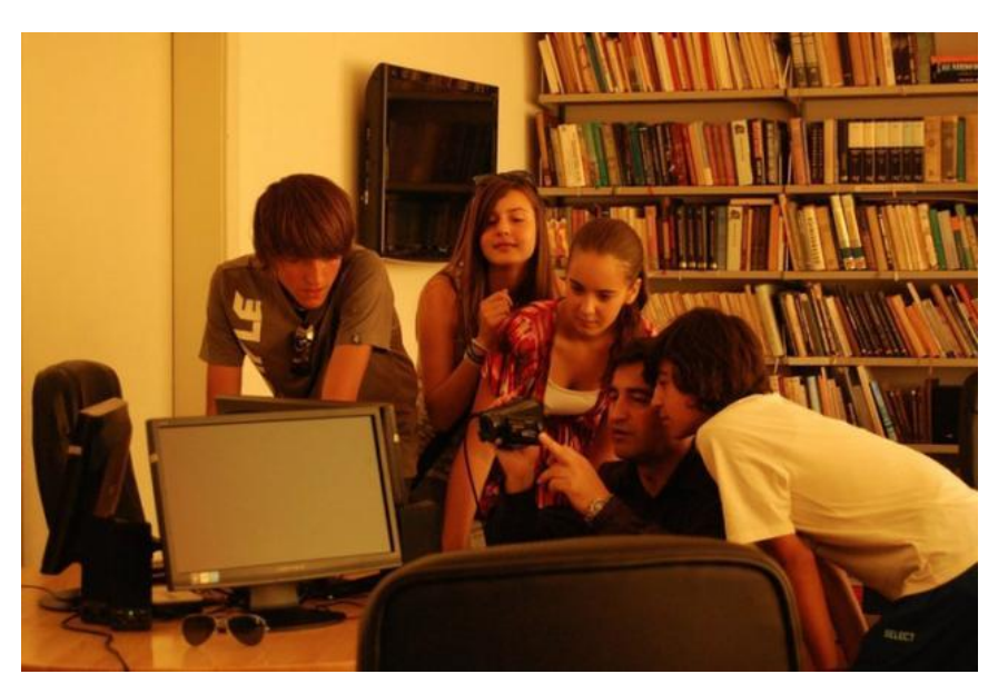
The Zavidovići Public Library has created a multi-media centre for 'the net generation'. These young people have made a film to promote their town.

To see how the Zavidovići Public Library changed its space from a traditional reading room to a space for young people, see <a href="https://www.youtube.com/watch?v=RAl7rCi_m-c">www.youtube.com/watch?v=RAl7rCi_m-c</a>.