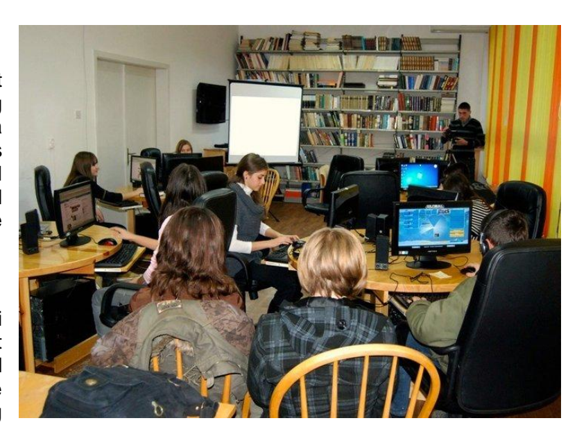
Students at the "School of Journalism" in Zavidovići Public Library, Bosnia and Herzegovina.

Partners include the Zavidovići Municipality. The Employment Agency, schools and Local Democracy Agency, all of whom were involved in marketing and promoting the project and who provided ideas and support for lectures and workshops. The Municipality also