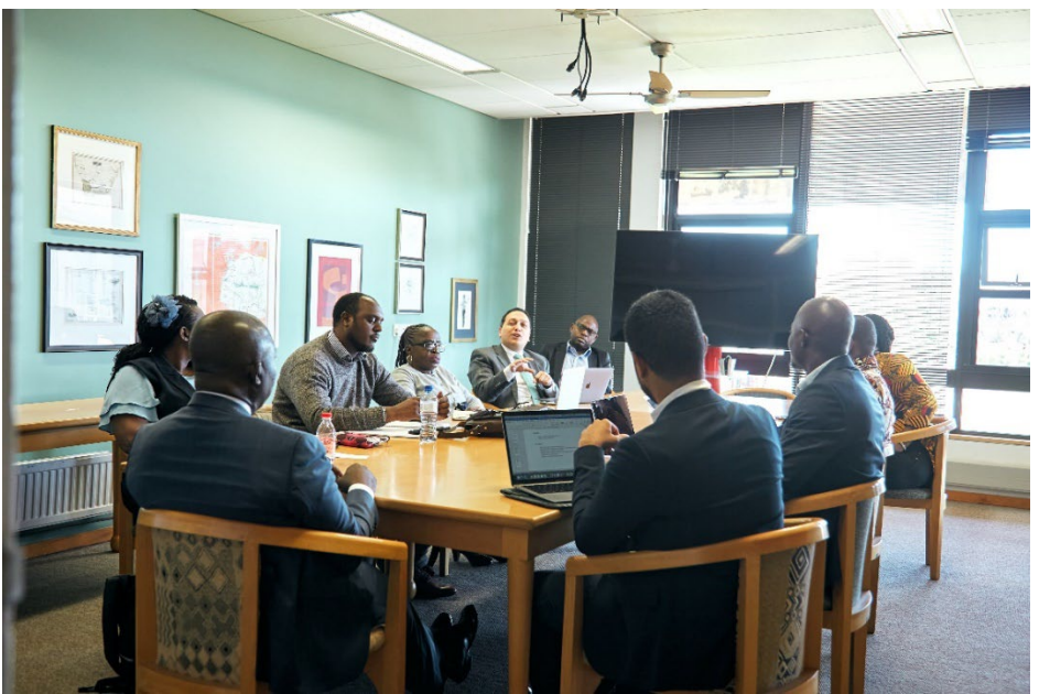
A meeting during Copyright Week at the University of Cape Town

Below is a summary of the South Centre's two public sessions. Highlights of the overall conference follow thereafter.