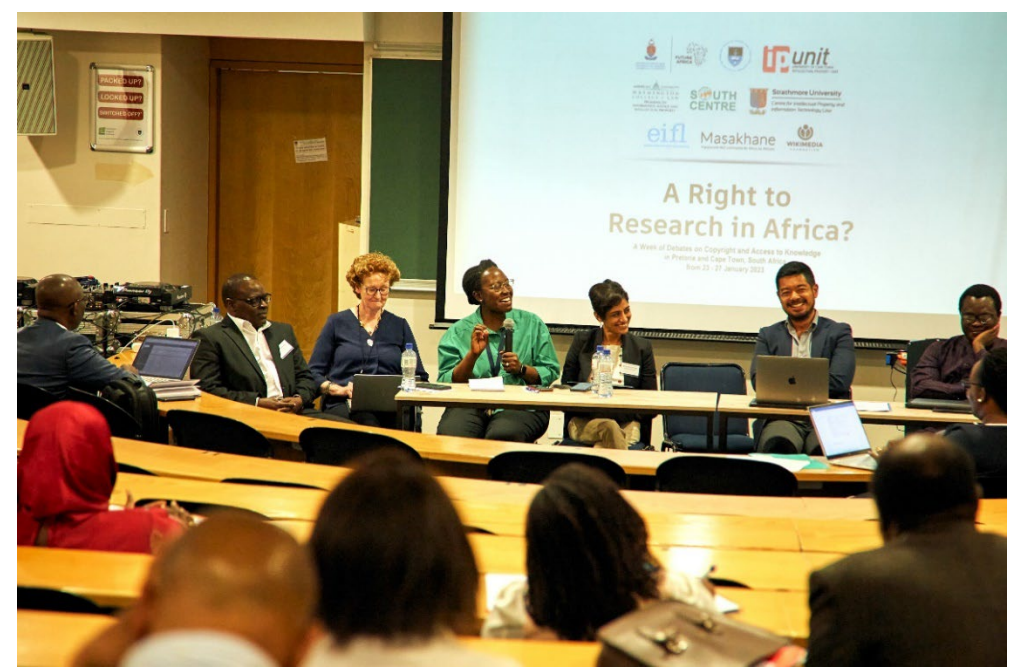
Second South Centre Public Session at the University of Cape Town

II. Strengthening the Voices of Africa & the Global South: New Directions in WIPO, AfCFTA and Copyright in Africa. Facilitating science, creativity and innovation: South Centre Public Session (University of Cape Town)