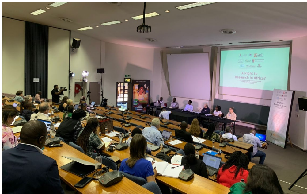
A session during Copyright Week at the University of Pretoria

A conference "A Right to Research in Africa? A Week of Debates on Copyright and Access to Knowledge" took place on 23-27 January 2023 at the University of Pretoria and the University of Cape Town, South Africa. The gathering of scholars, artists, librarians, researchers and government officials had the objective to discuss the evolution of copyright law and the role of limitations and exceptions (L&Es) to advance research in Africa. The week of debates was co-organized by the South Centre, ReCreate South Africa, Program on Information Justice and Intellectual Property (PIJIP) – American University Washington College of Law, Electronic Information for Libraries (EIFL), the University of Pretoria – Future Africa, the University of Cape Town – IP Unit, the Centre for Intellectual Property and Information Technology Law (CIPIT) – Strathmore University, Wikimedia Foundation and Masakhane.