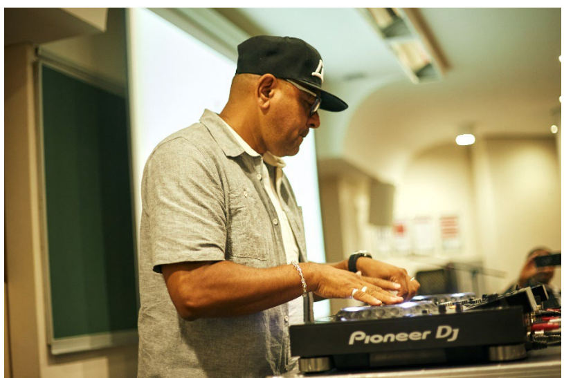
Renowned South African DJ Ready D

Some highlights of the discussions include: