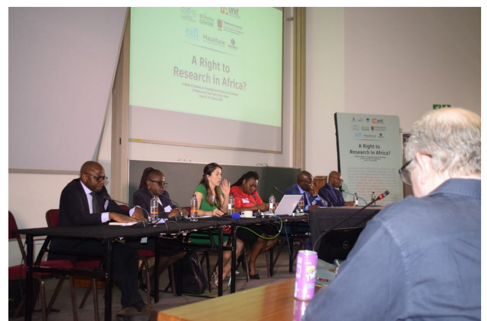
First South Centre Public Session at the University of Pretoria

I. African Leadership on Copyright and the Public Interest: South Centre Public Session (University of Pretoria)