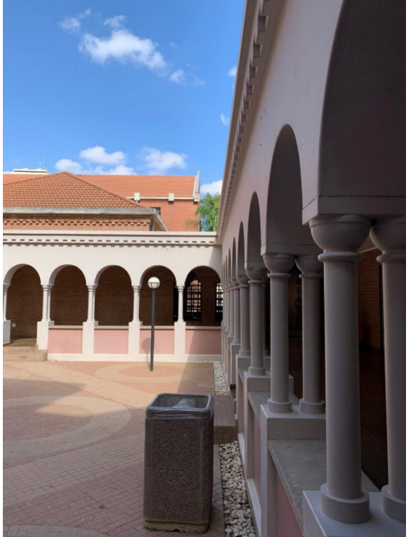
University of Pretoria

advocacy and from their case can be useful to other countries and should also be taken into account in the legislative amendment process.